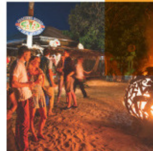
Full Moon Party