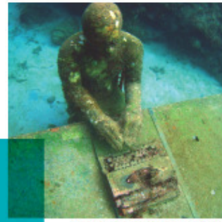
Underwater Sculpture Park

Grenada may be geographically at the bottom of the Caribbean chain, but it is top of the Caribbean island list of sensational holiday destinations. Grenada guarantees outstanding sailing in exciting cruising waters, incredible snorkelling and a lively Caribbean welcome whenever you step ashore.